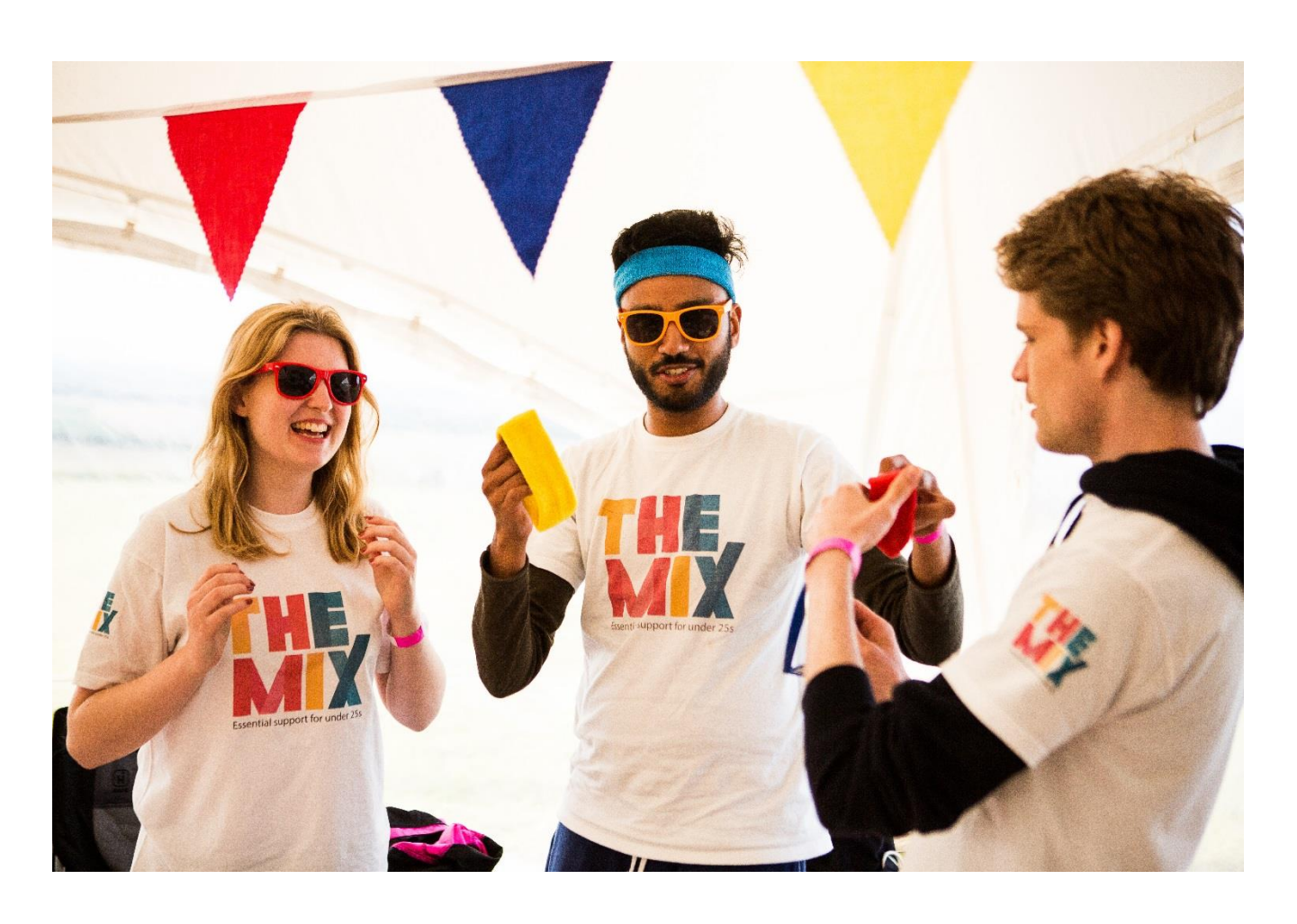
Have a look at our social media